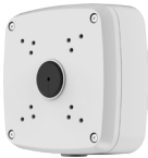
PFA121 Junction box