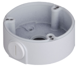
PFA135 Junction box